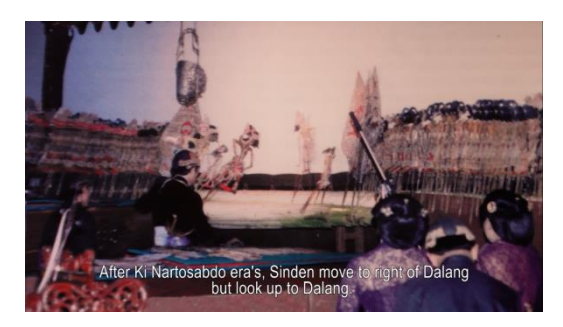
Fig. 13. Sinden photo footage still facing the mastermind. (Film: Pesinden Portrait, 2018, TC. 05:56)