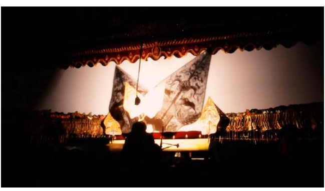
Fig. 6.Shadow puppet show. (Film: Portrait of Pesinden, 2018, TC. 02:45)

Picture 7 sources said that the Sinden was very supportive of the atmosphere to accompany the shadow puppet scene. Ki Purbo Asmoro added that there was probably only one singer in the past and that too was old. The sitting position is close to the drummer and facing the dalang . In the past, there were no ideas for a Sinden as a female figure who could be enjoyed not only in terms of her voice but also her appearance. Sinden used to be limited to sound quality. Figure 8 shows the Sinden singing to fill the gap in the shadow puppet scene.