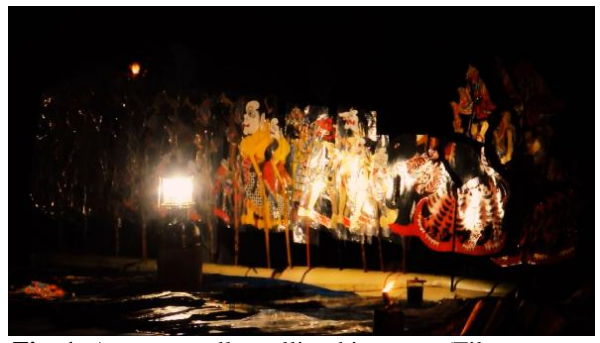
Fig. 1. A puppet seller selling his wares (Film scene: Portrait of Pesinden , 2018, TC. 00:20)

In the first segment, information is presented about how Sinden is in a Wayang show. Before going into the speaker's explanation about Sinden , pictures of the atmosphere around the time before the puppet show started. The picture is like the activity of people buying and selling Wayang and snacks. Sinden went up to the stage of the show and prepared before performing. Alternately, pictures are displayed between Sinden with explanations from sources. Other images such as Sinden singing and players playing gamelan. Figure 1 shows the sellers of Wayang kulit properties around the puppet show. Figure 2 shows a man who is choosing the Wayang kulit to buy. The picture shows gamelan musical instruments, the aim is to build an atmosphere to make it more felt by Wayang kulit performances. In Figure 3 the Sinden is singing before the shadow puppet show begins.