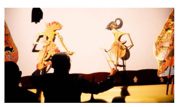
Fig. 11. Dalang playing the puppet. (Film: Portrait of Pesinden, 2018, TC. 05:35)

After the interviewee's explanation, Figure 11 appears showing the puppeteer playing his puppet. This is intended to be connected with the information provided by the previous informants. Ki Purbo Asmoro (Figure 12) said that during the Ki Nartosabdo era, the position of the Sinden had been moved to the front and was to the right of the dalang , but still facing the dalang , as shown in Figure 13.