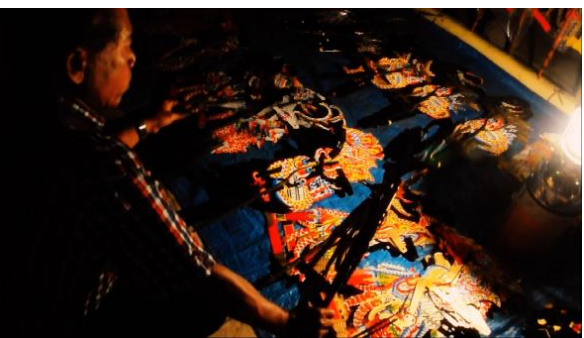
Fig. 2. Activities of residents who will buy Wayang (Film scene: Portrait of Pesinden , 2018, TC. 00:33)