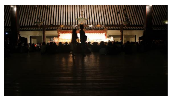
Fig. 9. The audience is getting closer to the stage watching the shadow puppet show. (Film: Portrait of Pesinden , 2018, TC. 05:02)

The pictures 9-10 are video footage that appears where the source provides information related to Sinden . The resource person (Rini Rahayu) explained that the Sinden is part of the show that must be considered besides the Wayang itself. According to Rini, the average audience in the past was more about watching and living the Wayang stories, not the appearance of the Sinden . But now that has changed, because Sinden has also become an important element of Wayang performances. Sinden can be an element of entertainment for the audience.