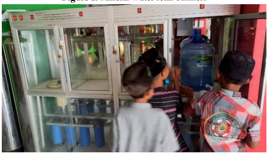
Figure 2. Mineral Water refill business