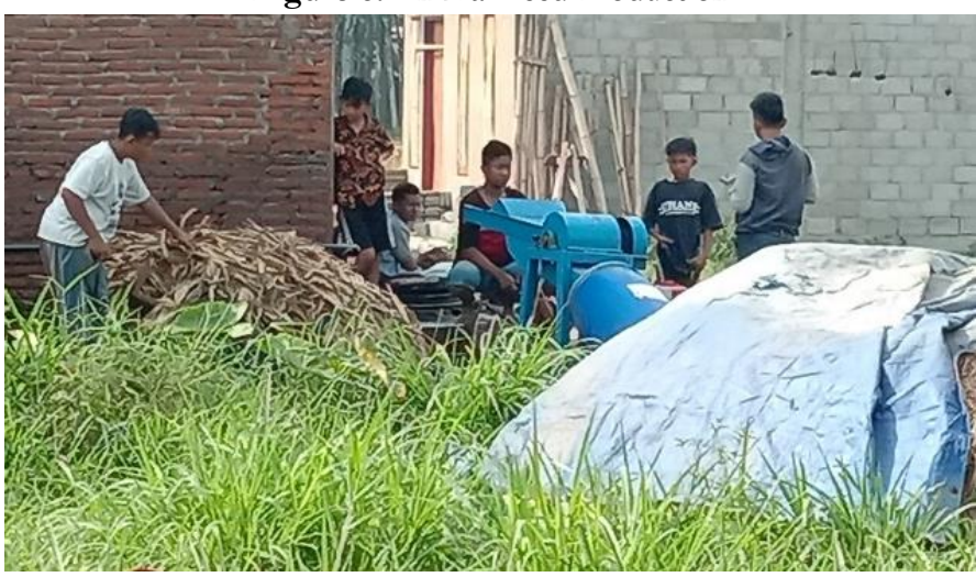
Figure 6. Animal Feed Production

Musical art is one of the interests of talent that is very thick with cultural skills that interest the surrounding community. As a musical coach, Bayu Sasongko, alumni of the Indonesian Institute of the Arts, Surakarta, facilitated this field. The average target set by Bayu is that the musical team must be able to play one gendhing or one song every week. In competitions and performances, the Al Amin people's pesantren karawitan team will usually play several pieces arranged into a beautiful and integrative mix of songs. There are messages of Islamic religious values in every combination of the songs. The people's boarding school activities can also be seen on the YouTube channel "Perak TV."