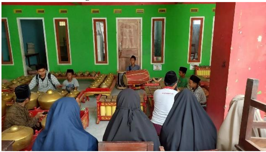
Figure 4. Field of Musical Arts

Along with Abdullah Sam's commitment to providing entrepreneurial fields for all students, the types of the entrepreneur at Al Amin people's boarding schools consist of various kinds. So far, the areas of entrepreneurship available at the Al Amin people's boarding school for its students include musical arts, agriculture, animal husbandry, workshops, refill water, orchid cultivation, herbal medicine.