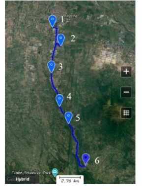
Figure 1. Location of Sample S. oleosa

S. oleosa samples were obtained from Mojokerto Jawak timur with the location points as shown in Figure 1. Location of Sample S. oleosa. The sampling distance based on the presence of S. oleose is not a predetermined point. S.oleosa was taken based on a survey in the Mojokerto area, then the altitude measurements were made at each point.