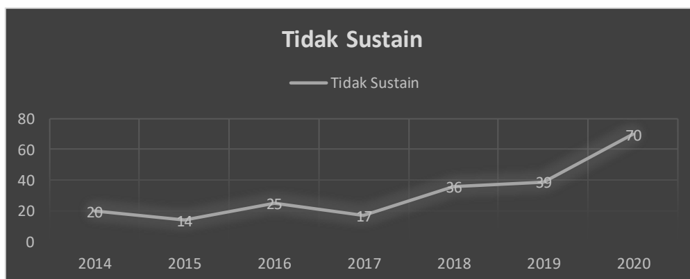
Figure 2. Firm with Financial unsustainability