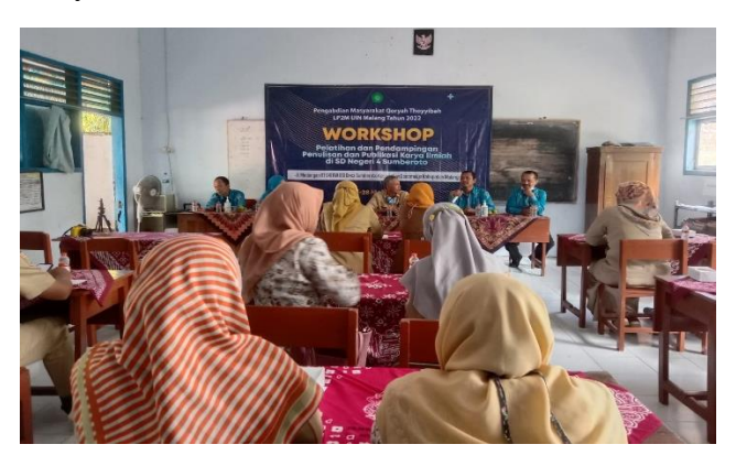
Figure 1 Opening Activities by the Principal of SDN 4 Sumberoto and the Lecturer Team of UIN Maulana Malik Ibrahim Malang

From the results of the analysis, it was found that writing skills are still low but there are opportunities if scientific publication training is carried out. So the theme of the training focuses on educating the importance of publishing scientific papers, because seeing the experience of teacher creativity during teaching is diverse and innovative, so it needs to be published so that it can be used as a reference by other teachers.