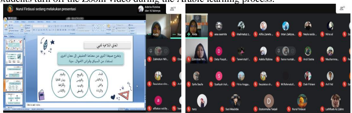
Figure 1. Virtual Classroom Images Class A Class B

The shift of the learning space from the classroom to the home has made student participation low in attending virtual class, which is evidenced in three aspects. First , students turn off the Zoom video during the Arabic learning process.