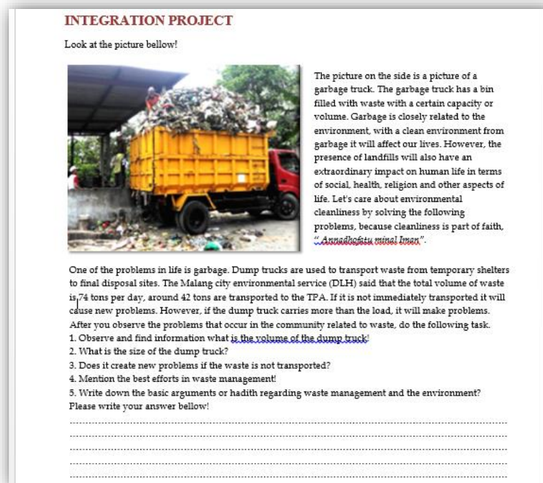
Figure 3. An Example of an Integration Project Developed by Integrating Islamic and Local Wisdom

After the cover, there is a student worksheet identity page, an introduction, guidelines for using student worksheets accompanied by an explanation of each component, a concept map of the material to be studied, and a table of contents. In addition, these students' worksheets also present Core Competencies, Competency Standards, Basic Competencies, and indicators of learning objectives. Each material is given activities that contain related sub-materials designed by constructivists using the daily context of students and Islam to find concepts. In addition, an integration project provides space for students to develop reasoning, research, and religion skills in a mathematics learning project.