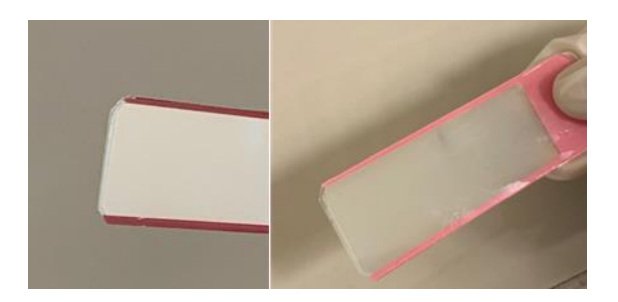
Figure 3. Result of Gambir Extract Nanoemulgel Homogeneity Test