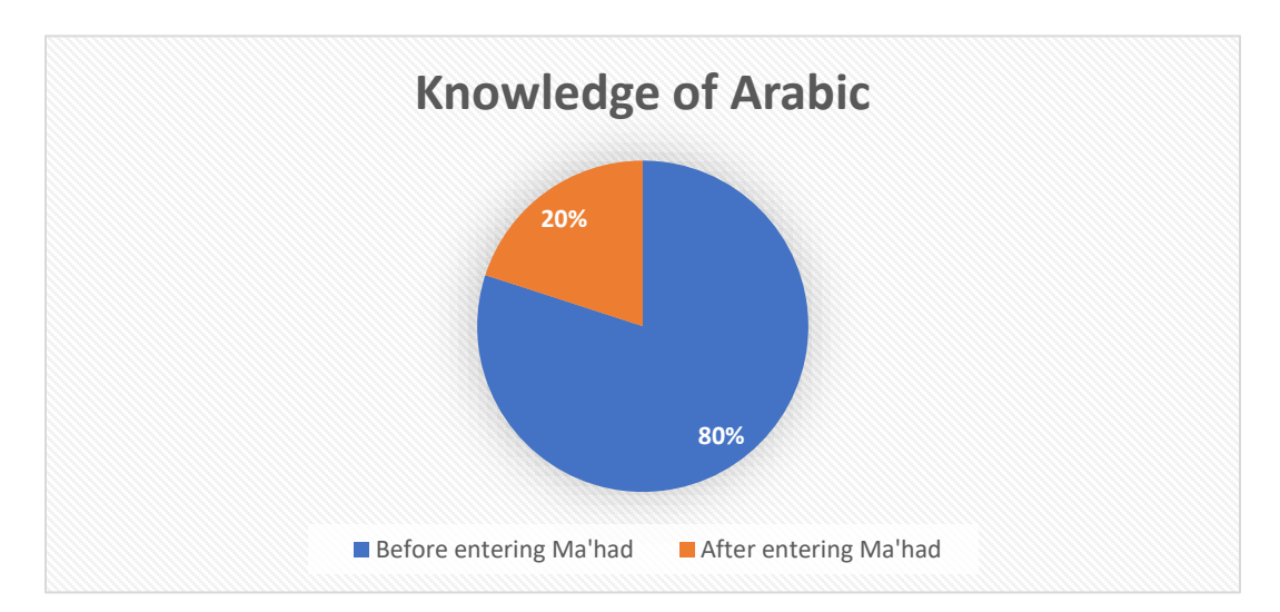
Diagram 1. Arabic language learning before or after entering Ma'had

the author interviewed 20 Ma'had Sunan Ampel Al-Aly students to obtain concrete data. Here are the interview results along with the diagram: