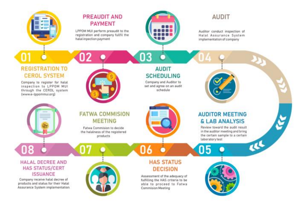
Figure 3: Halal Certification Procedures For Products Marketed Outside Indonesia (MUI, 2022)

In addition, the standards in the production operation process must certainly meet the criteria determined by LPPOM MUI or those that have collaborated with it. It consists of more than 40 global halal certification bodies. This extensive network strengthens the credibility of the LPPOM MUI certificate. Credibility is also supported by accreditation from the National Accreditation Committee for ISO/IEC 17065:2012 and from ESMA (Emirates Authority for Standardization and Metrology) for GSO 2055-2 (2015). Procedures and decisions on product halalness are handled by LPPOM MUI and the MUI Fatwa Commission. LPPOM MUI handles checking for adequacy of documents, scheduling audits, conducting audits, auditor meetings, issuing audit memoranda, submitting minutes of audit results at MUI Fatwa Commission meetings, making MUI Fatwa Commission decisions regarding product halalness based on audit results, and issuing MUI halal decisions(MUI, 2022). With blockchain technology, all stakeholders can have real-time access to each block, which describes the stages of the production process.