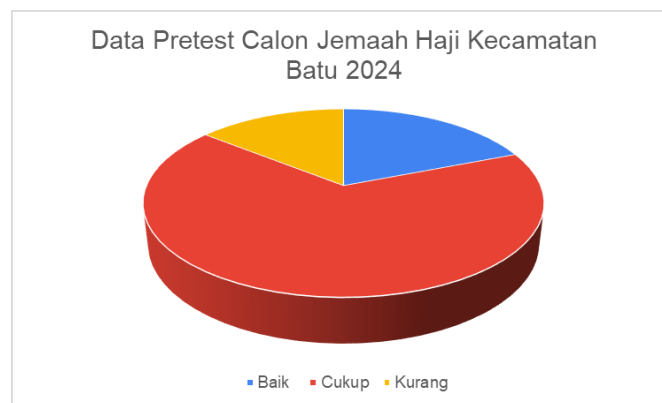
Figure 1. Diagram of the percentage of knowledge of prospective pilgrims before education

In the prospective hajj pilgrims of Batu district in 2024, the survey data showed that all respondents had practiced self-medication (100%), where 42.85% of the respondents obtained medicine by buying themselves and 57.14% obtained medicine by prescription or buying themselves.