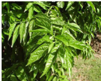
Fig. 1. Morphology of C. nutans leaves (Kamarudin et al. 2017)

(Stein et al. 2013). Therefore, investigation for new antidiabetic agents have continued. Medicinal plants that have been widely used empirically in traditional medicine practices have gained attention as antidiabetics, not just for safer alternative drugs, but also multi-tasking abilities for targeting various aspects in the treatment of diabetes include lowering blood glucose, increasing insulin biosynthesis, improving insulin resistance, enhancing the antioxidant system and prevent long-term complications due to hyperglycemia (Patel et al. 2012).