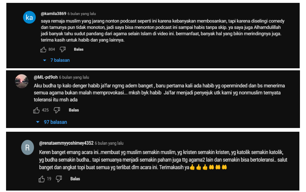
Figure 2. Positive Comments from Youtube Viewers About Habib Husein Ja'far's

There are also positive comments from YouTube viewers about Habib Husein Ja'far's delivery of religious moderation, reflecting the positive impact that the messages of religious moderation have had on his audience. These comments reflect how Habib Husein Ja'far's delivery has inspired, brought change, and provided valuable insights to his audience.