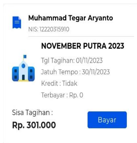
Figure 7 : Boarding Bill Menu Display Application E Provision of eNJe students