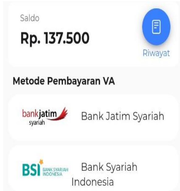
Figure 5: Top Up Menu Display of eNJe Student Provision E Application

money, with all the facilities provided by pesantren, such as basic clothing needs (school uniforms, ma'had, etc.), food (staple food), and board (student residence) can be paid online through payment with 'Tepping Card'".