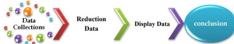
Figure 2: Data Collection Process

and Santri, all data obtained are classified and taxonomically made and reduced according to needs, at the initial stage, namely data collection, then data reduction is sorted in the form of records, And then it is carried out by describing the conclusions from the studied data.