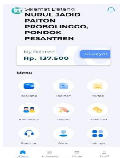
Figure 4 : The initial menu display of the eNJe student provision application