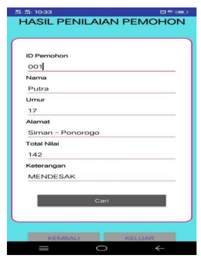
Figure 3. The final decision from Dispenku

from each sub-indicator is counted and the decision comes up. The result of the total score for deciding the dispensation marriage proposal can be seen in Figure 3.