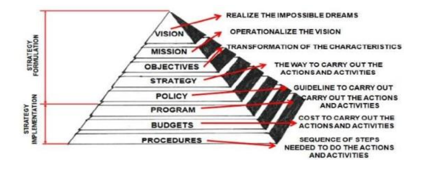
Figure 2. The definition of each steps in the Strategic Planning [2]