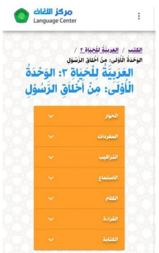
Figure 2. Online practice