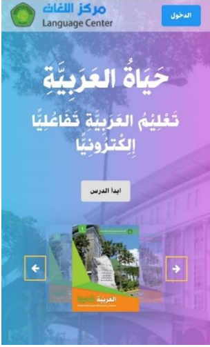
Figure 1. Dictionary

Apart from using books as learning guides, they also take advantage of the use of technology such as the Kamus Hati application which was created to support students in learning. In addition, students are also facilitated by online exercises which are carried out once a week to repeat and evaluate the learning that has been studied before so they don't forget. This online exercise is called murojaah online where students are given a link to work on the questions that have been provided by the Arabic Language Programming Center by book titile "Al-Arabiyyah lil Hayah" (Hamid et al. 2018). As the following picture: