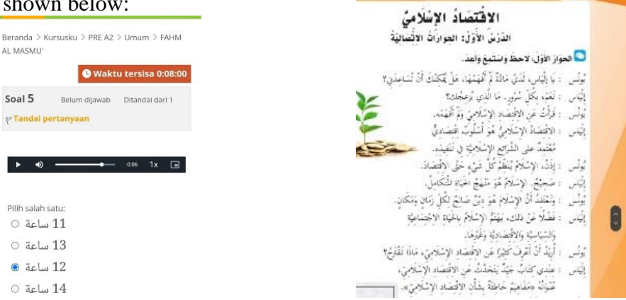
Figure 5. Practice Isma'