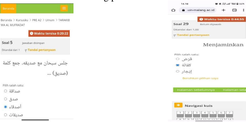
Figure 3. Mufrodat practice questions

input by the server. Like the following picture: