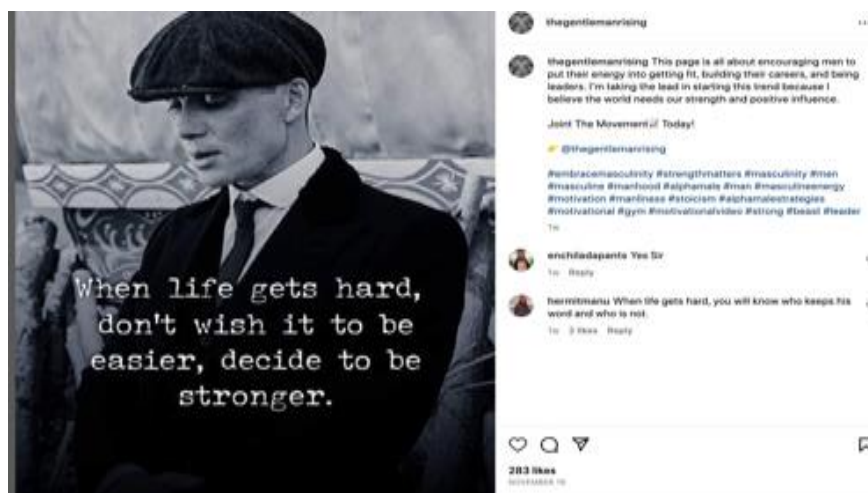
Picture 4. Thegentlemanrising Instagram Feed

the person who provoked them plays the victim when the response is negative. Provoke and Ugly Side: The expression " People will provoke you until they bring out your ugly side " reflects the idea that there is an attempt to bait or provoke someone into creating a negative reaction or undesirable behavior. In the context of toxic masculinity, there is pressure or challenge to patience, emotional control, or the masculine image perceived as " strong " and " invulnerable ." Playing the Victim: The statement " then play victim when you go there " indicates a dynamic where the person who provokes then takes on the role of the victim when someone responds in an undesirable way. This may reflect a manipulative behavior pattern where someone tries to avoid responsibility for their contribution to triggering a negative reaction. Power and Control Dynamics: This sentence reflects power dynamics that may occur in relationships, where efforts to provoke and then play the victim role can be used as a tool to maintain control or shift responsibility. Toxic Patterns: This expression depicts toxic patterns where individuals may seek ways to expose someone's negative or vulnerable side, and then use the negative reaction as justification to assume the role of the victim. It is important to remember that not all conflicts or provocative situations are related to toxic masculinity, and the tendency to behave toxically can occur in various contexts.