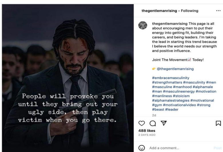
Picture 3. Thegentlemanrising Instagram Feed