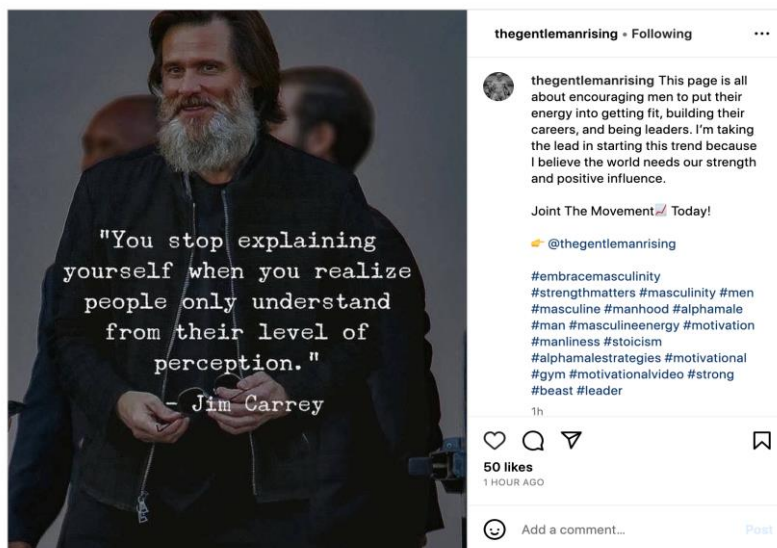
Picture 2. Thegentlemanrising Instagram Feed