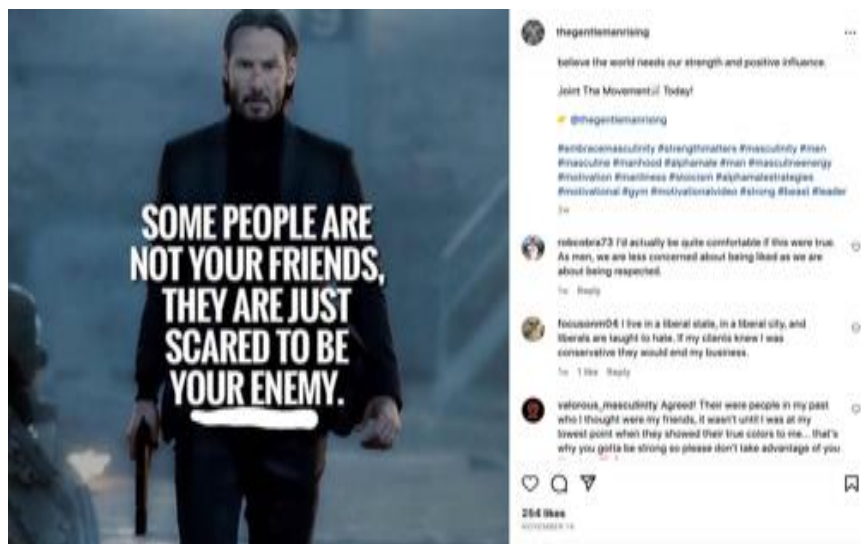
Picture 6. Thegentlemanrising Instagram Feed