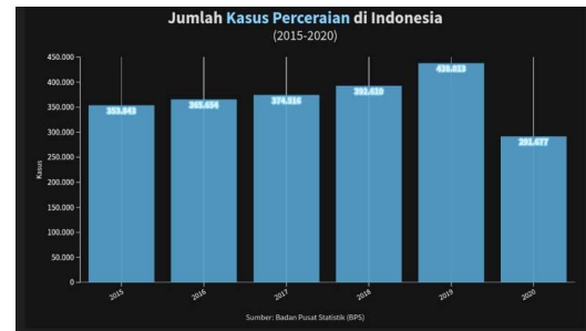
Gambar 1. Jumlah Kasus Perceraian di Indonesia (2015-2020)