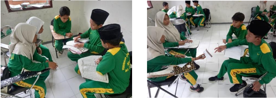
Figure 6 Discussion process with group members

In the fifth step of the discussion phase within the Numbered Heads Together strategy for learning Arabic text listening, collaborative understanding among students is pivotal. Following the group's collective listening to the Arabic text, students engage in reflection, analysis, and consolidation of their responses or comprehension of the teacher's provided questions or tasks. This collective thought process fosters active participation from all students, fostering a dynamic discussion environment and reinforcing comprehension through cooperative efforts. This phase not only builds listening skills, but also nurtures students' group intelligence and critical thinking skills.