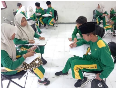
Figure 3. Group formation