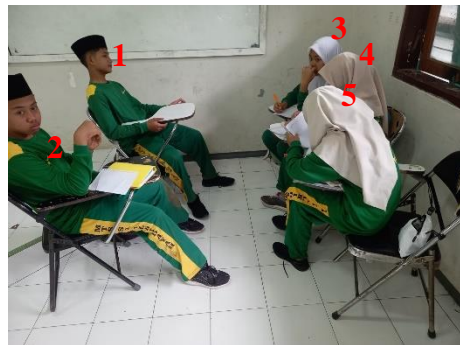
Figure 4. Numbering each group member

In the third phase of Arabic text listening, students engage in a vital activity aimed at honing their listening skills. This involves direct reading of the Arabic text by the researcher. The reading is drawn from the istima' material, focusing on qira'ah material, which facilitates comprehension by providing emphasis, intonation, and clarification. Furthermore, it allows for speed adjustments and offers guidance that aids understanding. The researcher read the text by moving around the class, not standing in one place. This strategy aims to ensure students' full attention, create direct interaction and promote whole-class involvement in listening activities.