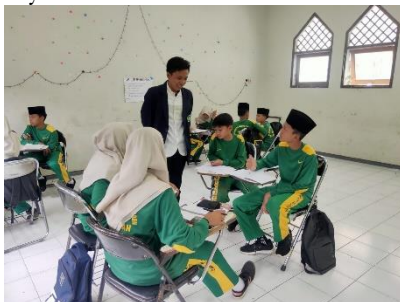
Figure 5: Students listen to the spoken text

According to the teacher, the listening process greatly helps students in understanding sentence structure, vocabulary, and the context in which words are used in everyday situations. She explained that by listening to texts, students can improve their ability to understand the language orally, which in turn helps build their communication skills. The teacher emphasized that this listening ability not only helps students in understanding Arabic, but also prepares them to interact in the context of the language more comprehensively in daily life. The Arabic text that is played to students is the material in figure 2.