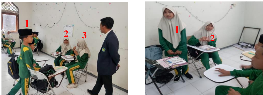
Figure 7. Student number 1 in each group answers question number 1.

The sixth stage represents a listening skill learning strategy employing the cooperative learning model known as Numbered Heads Together 33 . Learning strategy is something that is done by someone to implement certain methods, namely learning styles using certain methods either individually or in groups 34 . In other words, a learning strategy is a conceptual framework that describes systematic procedures in organizing learning experiences 35 . Learning strategy can also be interpreted as a learning activity that teachers and students must do so that learning objectives can be achieved effectively and efficiently 36 .