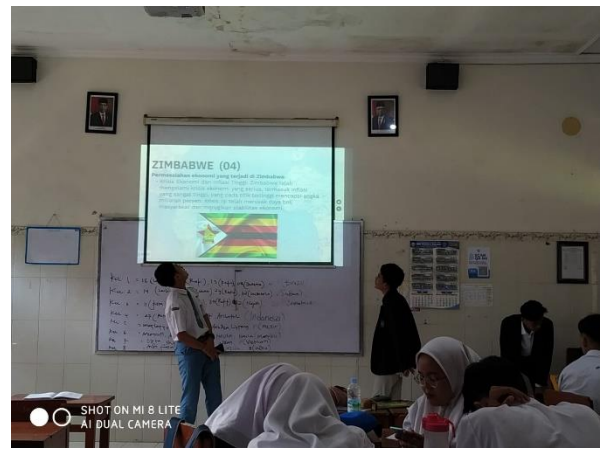
Figure 3. Project Presentation