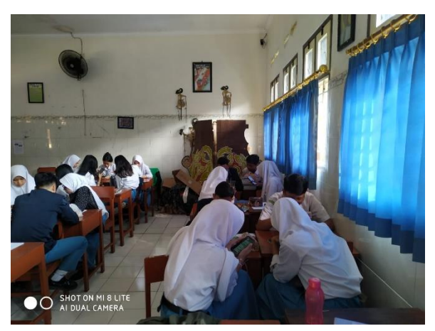
Figure 2. Grup Discussion

ASANKA: Journal of Social Science and Education, Volume 05, Number 02, 2024