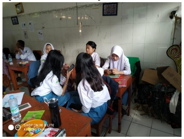
Figure 1. Analysing the Material to be Studied

The combination of Flipped Learning and Project-Based Learning (PBL) starts with defining the learning objectives and designing a relevant project. The teacher then provides learning materials, such as videos or readings, that students should study at home. After students have studied the material independently, the class begins with a discussion to clarify students' understanding before grouping students to work on the project. The teacher monitors and guides students during the project work, providing feedback at regular intervals. Once the project is complete, students present the results and reflect on the learning process. Finally, an evaluation is conducted to assess learning outcomes and plan for further development.