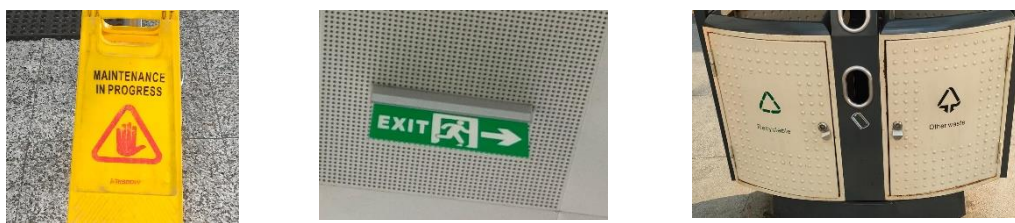
Figure 1-4. Monolingual in English

Gambir Station has the highest number of monolingual English signs of the other two stations. This is because Gambir station is the main station that local and international passengers often use, so the need for information in English is higher. Manggarai Station has the second highest number of monolingual English signs after Gambir Station. Manggarai Station is a transit centre for the KRL Commuter Line, so it really needs lots of English signs to facilitate international passengers. Dukuh Atas BNI MRT Station has the fewest monolingual English signs of the two other train stations because local residents dominate passengers at the Dukuh Atas BNI MRT station.