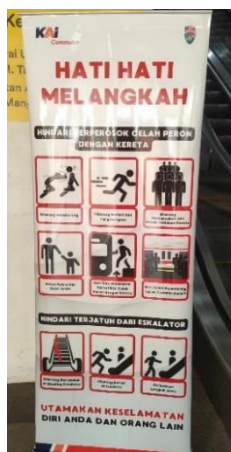
Figure 17. Warning Board for Passengers at the Train Station

Symbolically, the use of English, such as the word "Exit", shows the station's readiness to serve passengers from different language backgrounds, creates an inclusive environment, and facilitates international mobility at Jakarta station. The presence of bilingual signs on these directional signs also strengthens Jakarta's identity as a transportation centre that supports linguistic and cultural diversity.