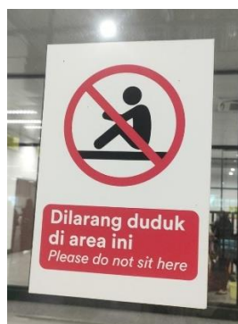
Figure 15. Prohibition Sign Board at the Train Station

According to Landry & Bourhis' theory (1997), landscape linguistic refers to language in the public space of a place, and landscape linguistic describes the distribution of social and ethnolinguistic power in a place. The landscape linguistic has two functions, namely an informative function and a symbolic function. The informative function is demonstrated by the existence of landscape linguistics as geographical markers for speakers of certain languages in certain regions. In this case, language has a role in providing useful information, such as services, routes, and directions to a place that can be found through signs, advertisements, street names, and other forms of writing. Meanwhile, the symbolic function is associated with the existence of an landscape linguistic as the value and status of a language compared to other languages in society. The symbolic function is related to the depiction of personal social identity, community dynamics, and cultural meaning through public language (Rizki Pratama & Kartika, 2023; Widiyanto, 2019).