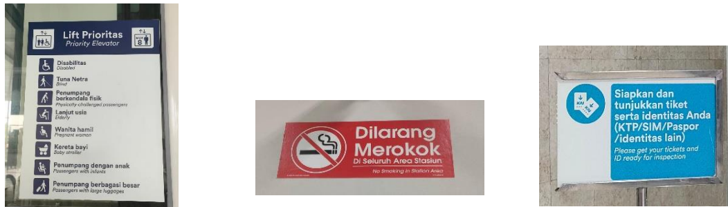
Figure 9-12. Bilingual in Indonesian-English

effective in helping passengers from abroad who have not fully mastered Indonesian.