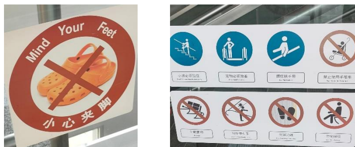
Figure 13 & 14. Bilingual Signs in English-Mandarin

As described in Table 3, researchers found 4 English-Mandarin bilingual signs at the Manggarai train station. Although there are not as many Indonesian-English bilingual signs at the Manggarai station, the 4 English-Mandarin bilingual signs at the Manggarai station that researchers found indicate that the Manggarai station is making efforts to provide information in these two languages. However, researchers did not find any bilingual English-Mandarin signs at the Gambir station and the Dukuh Atas BNI MRT station. The absence of these languages at the Gambir and Dukuh Atas BNI stations shows that there is a higher priority in language selection, such as prioritizing English and Indonesian at these two stations.