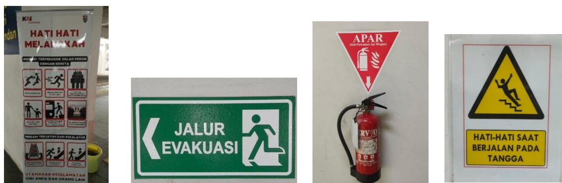
Figure 5-8. Monolingual Indonesian

Gambir Station has the highest number of monolingual Indonesian signs of the other two stations. This illustrates that local passengers dominate at Gambir station. The existence of this monolingual Indonesian sign makes it easy for local passengers to get clear and easy-to-understand information. Manggarai Station also has quite a lot of monolingual Indonesian signs, which makes it easier for local passengers to get information. Dukuh Atas BNI MRT Station has the fewest monolingual Indonesian signs of the two other stations. However, as a central train transit station, this number is still quite easy for local passengers to get clear and easy-to-understand information.