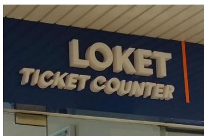
Figure 19. Service Instruction Board

Next, at Gambir station, researchers found foreign passengers to be interviewed with the same questions but asked in English. According to the passenger, the signs at Gambir station were quite clear and useful for him. There is a bilingual Indonesian-English sign. Station passengers feel helped by the English translation because they feel they don't understand Indonesian, foreign passengers can access important information at the station that they need very easily. The passenger felt helped by the Indonesian-English bilingual sign at Gambir station; for example, when the passenger was looking for a place to buy a ticket, the passenger was helped by the Indonesian-English bilingual sign, as in Figure 19 below.