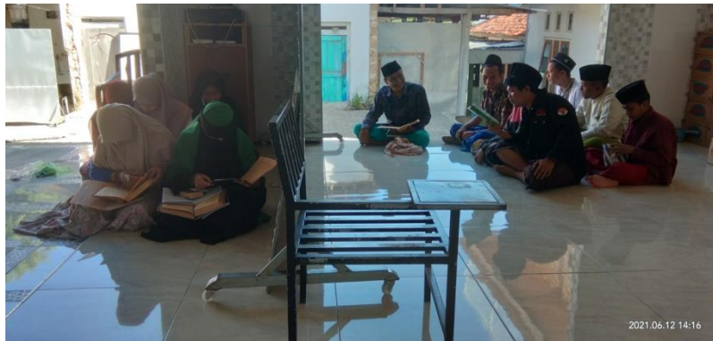
Figure 1. Overview of Fushah Arabic Language Learning

Figure 1, explains the procession of learning Fushah Arabic which utilizes the Book of Fathul Qarib as its learning media. Santri and santriwati read the book in the morning and deposit their memorization to the ustadz or mentor. This is accompanied by an understanding of the students' book memorization. With that, students have gained some vocabulary from memorizing and understanding the book of Fathul Qarib every day.