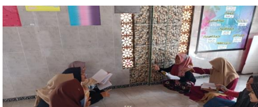
Figure 3 shows the same book as the book in Figure 3, studying the science of Fiqh in it. And the language structuring structure in the two books is in accordance with the rules of Arabic which can also be called Fushah Arabic. With the arrangement of Fushah Arabic, making the two books above the basis for ustadz/ustadzah teaching materials for learning Fushah Arabic.

Figure 2 is about the book known as "Fathul Qarib al-Mujib fi Syarh Alfaz al-Taqrir" which is one of the teaching materials used for santri in learning fushah Arabic, which discusses fiqh law and is based on the Shafi'i Madhhab. In the Shafi'i Fiqh literature, the book is a very important book because it is used as basic learning by santri or beginners.