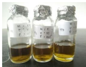
Figure 1: Sytem Of Microemulsion F1, F2 and F3