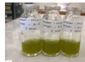
Figure 3: Gel Preparation Rep 1, Rep 2, and Rep 3