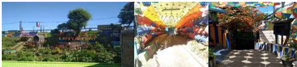
Figure 6. The corridor in Kampung Tridi After Rebranding.