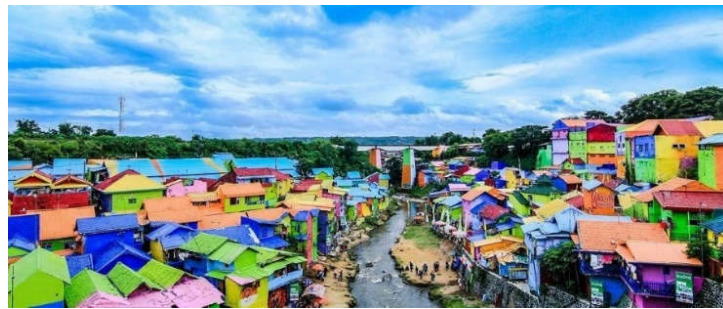
Figure 2. Kampung Tridi, after rebranding.