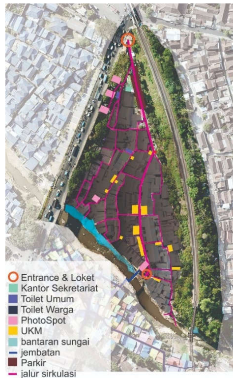
Figure 3. The layout of Kampung Tridi after rebranding.

Public and private space territory is changing after rebranding (Figure 3). It is because of functional adaptation and space needs, background, and existence. Private and public space territory is changed after rebranding because of functional adaptation, space requirement, background, and existence. The most visible transformation in this kampung is the local economic activity that occurs by using the front space of the houses (terrace and living room) as a space to sell foods and drinks (Figure 4). This phenomenon spreads in several spots in this kampung.