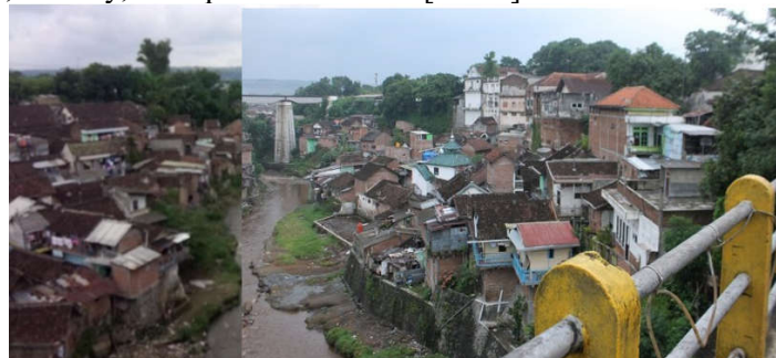
Figure 1. Kampung Tridi, before rebranding.