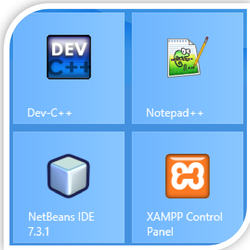
Figure 1: Application Program

A. Identify these applications programs and mention the usefulness.