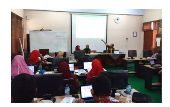
Figure 5. Procession of Participant Questions and Answers with the Implementation Team

From the results of the performance, illustrates that the participants are enthusiastic