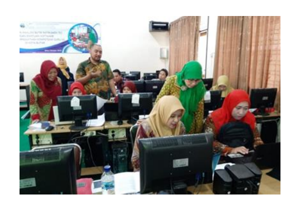
Figure 6. Participant Assistance by the Implementation Team