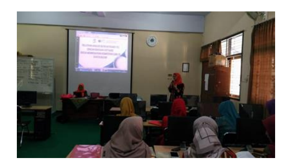
Figure 2. Submission of material by Yuniawatika, M. Pd.