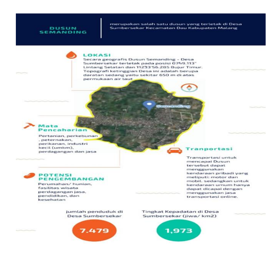
Figure 1 Semanding Hamlet Infographics. The figure above shows the location of Semanding Hamlet, transportation mostly used by people there, the potential in some majors, and people's occupation.

The health service facilities in Semanding Hamlet area are one Poskesdes (Village health post) and one Posyandu (integrated health post). Each RT has representatives of health cadres who work at Posyandu. Unfortunately, Posyandu activities are still temporarily suspended because of the pandemic. Socialization of the application of health protocols is still very rarely carried out and from the results of our observations, there are many residents who rarely wear masks and there is no adequate CTPS (Cuci Tangan Pakai Sabun/Hand Washing with Soap) facilities in Semanding Hamlet area. In addition, in Semanding Hamlet, there is Ar-Rohmah Islamic Boarding School whose students come from Malang city or outside Malang city, which may be a red zone or a black zone [8].