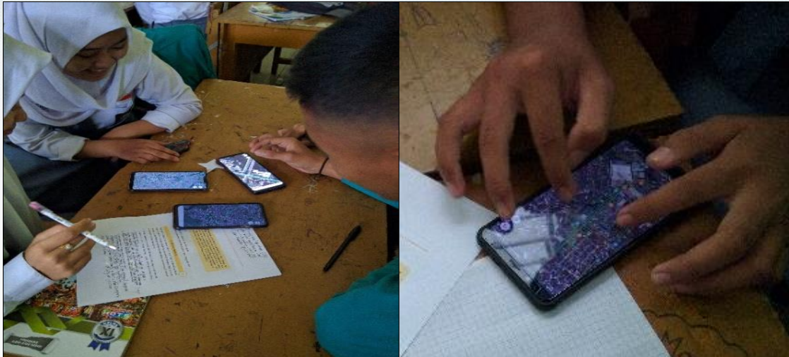
Figure 1. Students discussion method by using google earth in urban schools